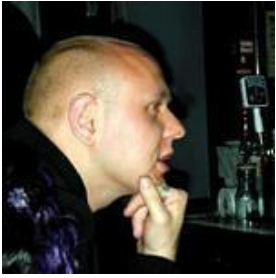
deejay s profile