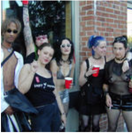
six ways to spell trouble