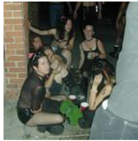
squatting on the sidewalk