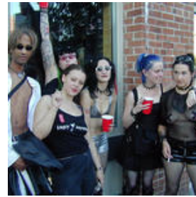
six ways to spell trouble