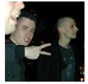
lynx pathogen goblyn