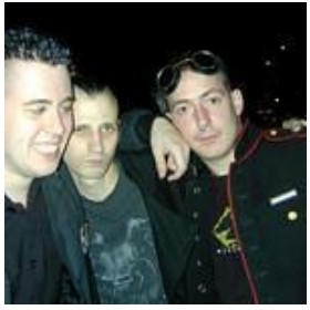
pathogen goblyn rabbit